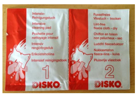
Intensive cleaning kit wet/dry