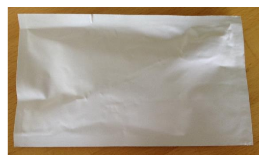
Pre-moistened special cleaning swab